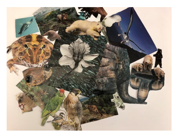
Artwork by: Serena Beard, grade 12

The course emphasizes active and meaningful communication in French as well as the ability to understand the language in a variety of contexts. Students are expected to express themselves with reasonable fluency and accuracy in both written and spoken language. Students will reach a level of proficiency in the language skills that enable them to read magazines, newspapers and on-line content as well having the ability to read with comprehension works of poetry, plays and prose passages of French Literature. Students will continue to understand French language and literature through the prism of the French-speaking world. Students will learn to communicate effectively through oral, written and nonverbal means. Students will be able to easily understand the main idea and some details of most video, audio and texts in French. This course is weighted on the general scale .