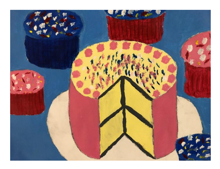
Artwork by: Nathan O'Melia, grade 11

How does one critically read and analyze a text? The AP English Literature and Composition course aligns to an introductory college-level literary analysis course. The course includes intensive study of representative works from various genres and periods, concentrating on works of recognized literary merit. Writing assignments focus on the critical analysis of literature and include expository, analytical, and argumentative essays. College credit is contingent upon passing the Advanced Placement exam. Students should be able to read and comprehend college-level texts and apply the conventions of Standard Written English in their writing. Summer coursework is required. Students are expected to take the AP exam at the end of the course (for which there is an approximate fee of $95).